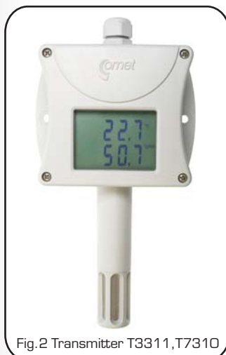
Fig. 2 Transmitter T3311, T7310