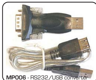
MP006 - RS232/USB converter

- Comet probes with Pt 1000 sensors are directly connectable to T4311 transducer - see further. There is a symbol /O behind probe name.