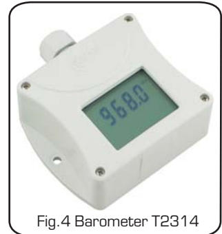
Fig. 4 Barometer T2314