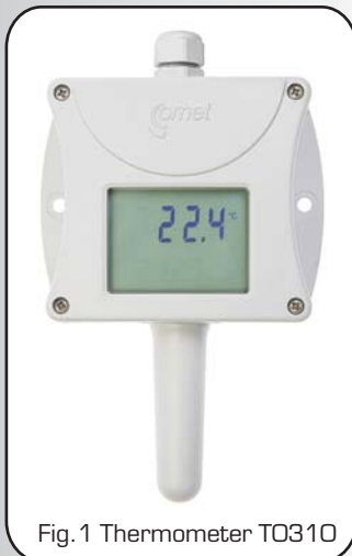
Fig. 1 Thermometer T0310

Barometer enables to measure sea level pressure by setting of correction to altitude above sea level.