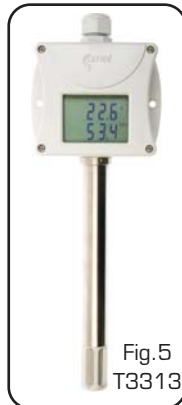
Fig. 5 T3313