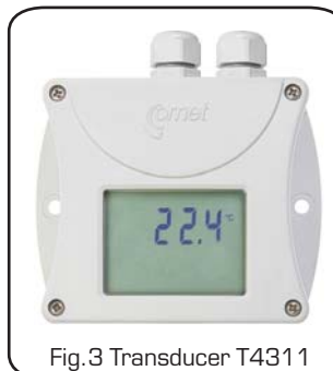
Fig. 3 Transducer T4311