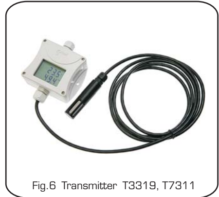
Fig. 6 Transmitter T3319, T7311