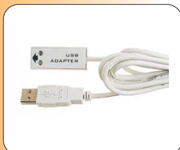
USB adapter for communication with the PC