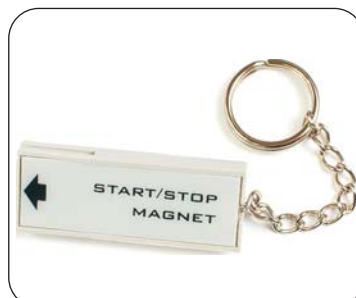
LP004 - start/stop magnet