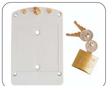
F9000 - wall holder with lock