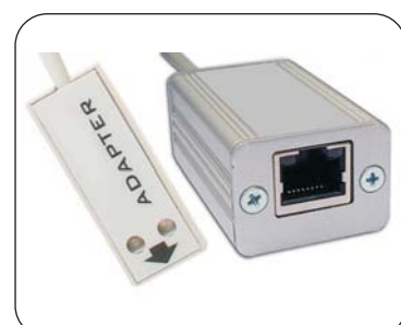
LAN adapter for communication with the PC via LAN network