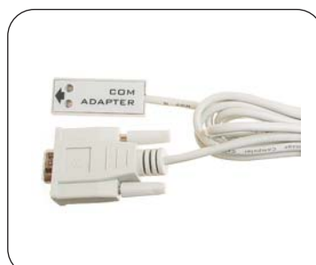
COM adapter for communication with the PC via COM port